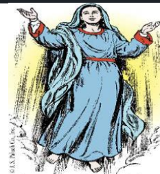
Assumption of the Blessed Virgin Mary

Bulletin Inserts for the Liturgical Life of the Parish: The Mass © 2020 Archdiocese of Chicago: Liturgy Training Publications. All rights reserved. Written by Paul Turner. The Roman Missal © 2010, ICEL. All rights reserved.